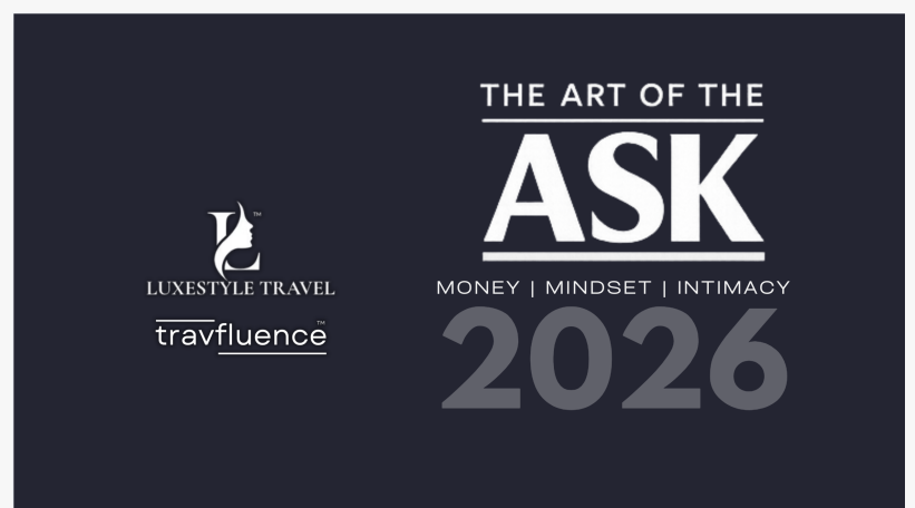
The Art Of The Ask - 2026