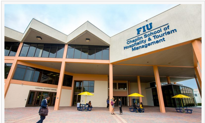
FIU Chaplin School of Hospitality & Tourism Management