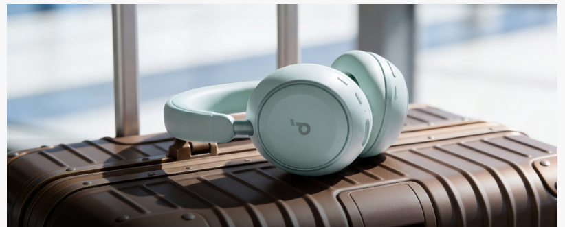
Soundcore Space 2 Headphones Are Ideal For Travel