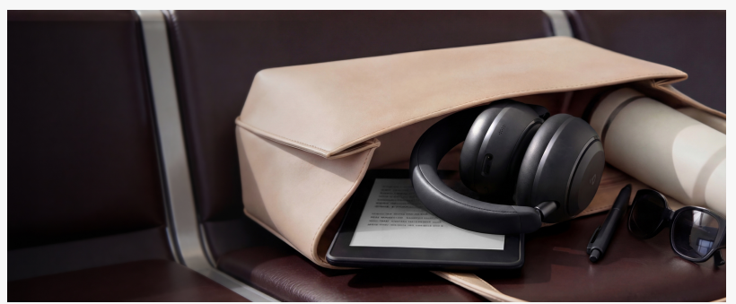
Soundcore Space 2 Headphones With Strong ANC Are Perfect For Travel

For audio, the Space 2 delivers clear, high-resolution sound powered by double-layer diaphragm drivers. The 40mm drivers combine a silk diaphragm with metal ceramic to produce full, rich bass, clear vocals and crystal-clear highs, no matter the type of music or media.