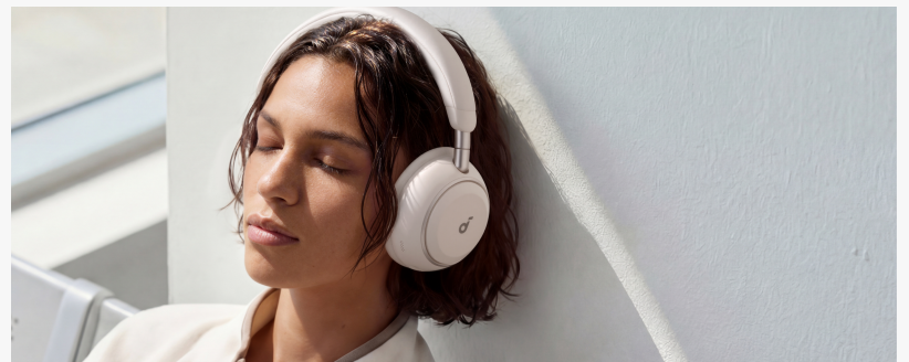
Soundcore Space 2 Headphones Help Silence Jet Noise During Travel