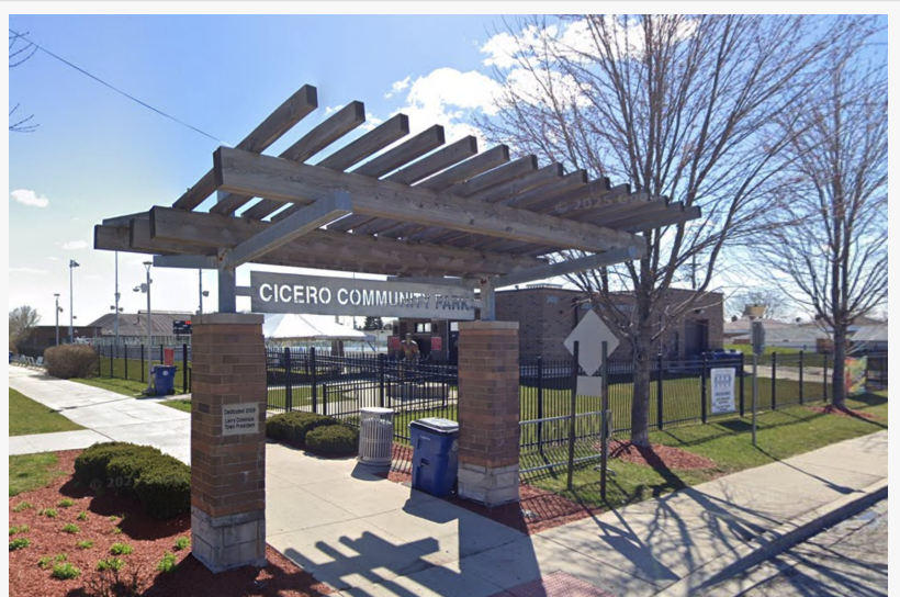
Cicero Community Park in Cicero, Illinois