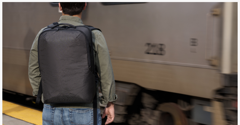
SLNT COMSEC Faraday Backpack

SHERIDAN, WY, UNITED STATES, March 5, 2026 /EINPresswire.com/ -- SLNT is proud to announce the commercial release of the COMSEC Courier Faraday Backpack, a mission built, SBIR developed solution engineered to secure classified devices, cryptographic material, and sensitive communications equipment in the most contested environments. This product originated from SLNT's seventh awarded SBIR contract with the United States Air Force and represents a major advancement in the protection of COMSEC assets during transport.