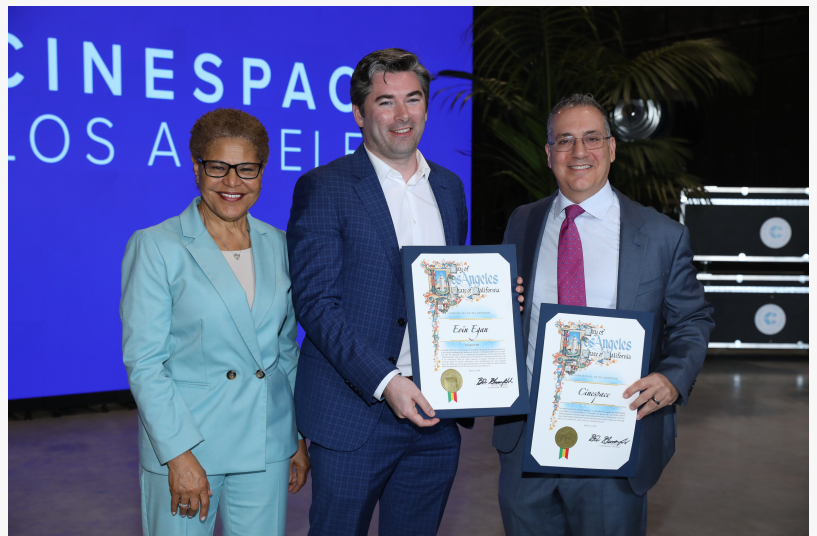
Mayor Bass, Eoin Egan and Councilman Blumenfield at the grand opening of Cinespace Los Angeles in Woodland Hills