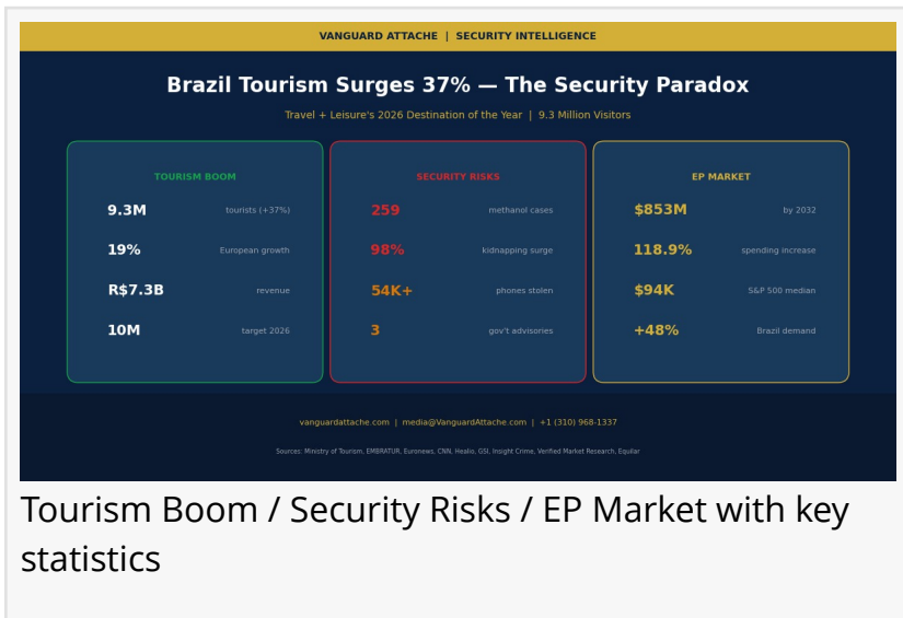
Tourism Boom / Security Risks / EP Market with key statistics

The executive protection market reflects a broader shift in how corporations approach travel risk. Global EP spending is projected to grow from $427 million in 2024 to $853 million by 2032, a 10.37% compound annual growth rate, according to Verified Market Research. Corporate security budgets have expanded sharply: median executive protection spending among S&P 500 companies reached $94,276 in 2024, up 118.9% from 2021, per Equilar proxy