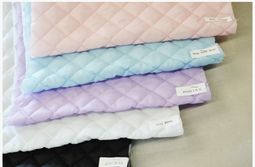
Quilted Polyester Batting Fabric-