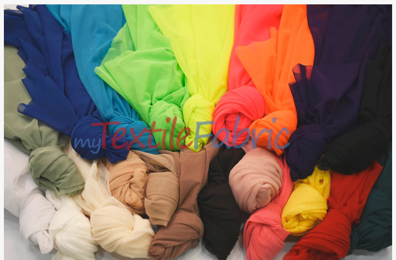
Super Soft Power Mesh Spandex-