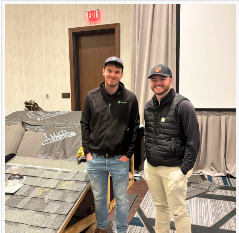
Hatch Homes team members at the Owens Corning Contractor Roofing Application Fundamentals training in Charlotte, NC – ready to bring top-tier roofing techniques back to the job site.

As an Owens Corning Preferred Contractor , Hatch Homes maintains ongoing alignment with manufacturer-certified installation standards. During the Charlotte-based training session, instructors utilized a full-scale constructed roofing model to demonstrate proper integration of synthetic underlayment systems, starter shingles, flashing assemblies, ridge ventilation