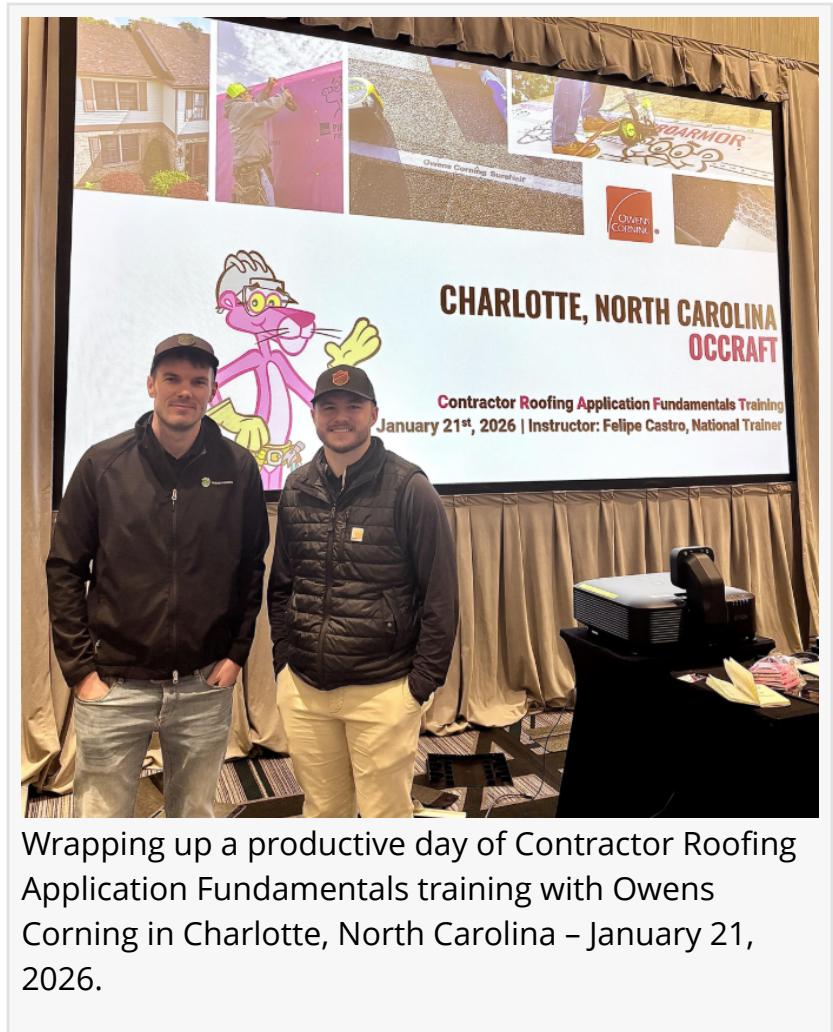
Wrapping up a productive day of Contractor Roofing Application Fundamentals training with Owens Corning in Charlotte, North Carolina – January 21, 2026.

This press release can be viewed online at: https://www.einpresswire.com/article/896890106