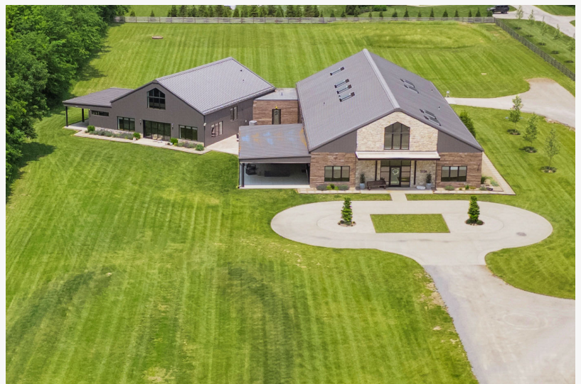
The Liberty Township Estate: 3226 Bean-Oller Rd, Delaware, OH 43015

The two-story main residence features five bedrooms, five full bathrooms, and one-half bath. Multiple fireplaces anchor the primary living spaces, while expansive windows bring in natural