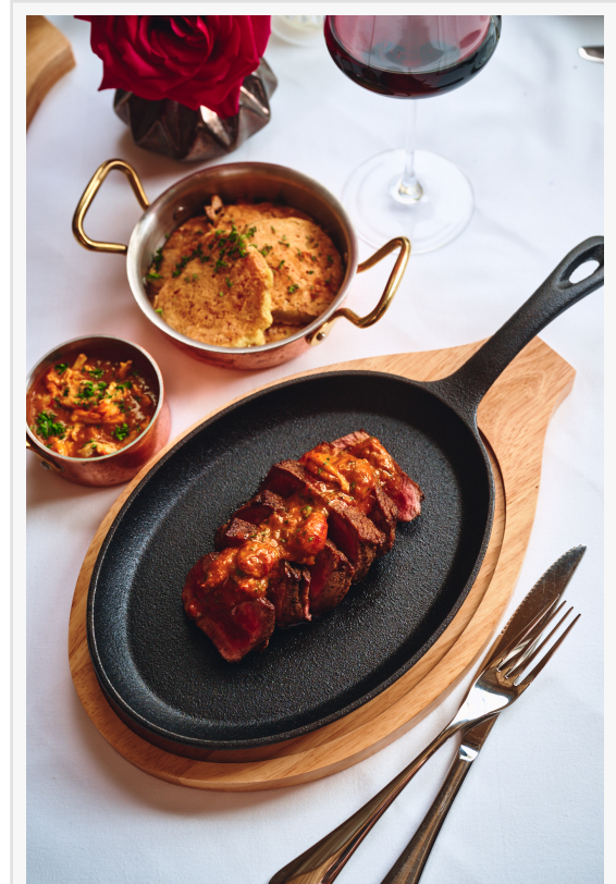
Filet of Beef Creole at The Grill Room

Every dish is a love letter to another time, thoughtfully revived and reimagined by today's culinary team to honor the chefs and visionaries who shaped The Grill Room's enduring reputation. In celebrating their work, the restaurant invites guests to rediscover the refinement, romance, and quiet luxury that have long defined dining at The Windsor Court.