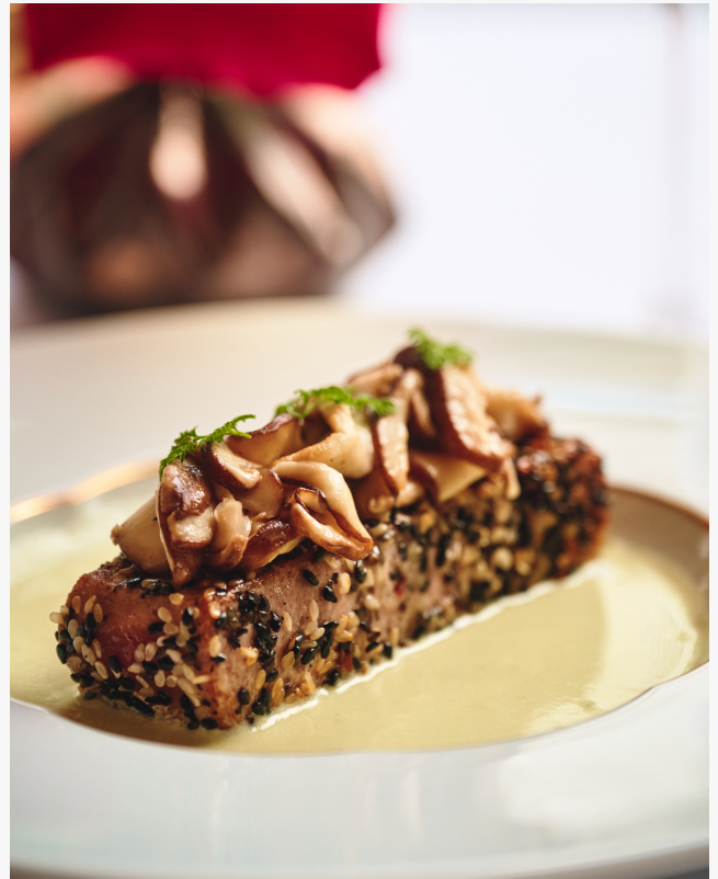
Tuna with Two Sesames at The Grill Room