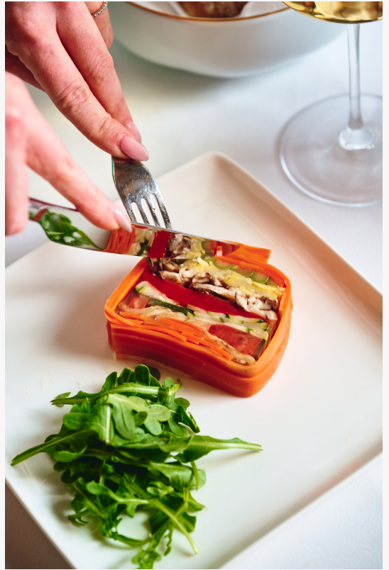
Vegetable Terrine at The Grill Room