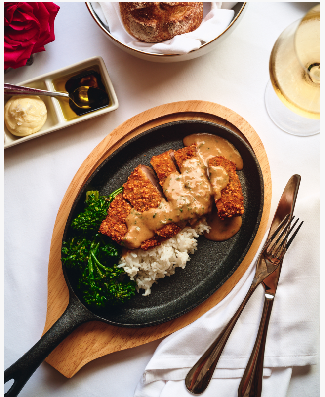
Cashew Breaded Duck Breasts at The Grill Room