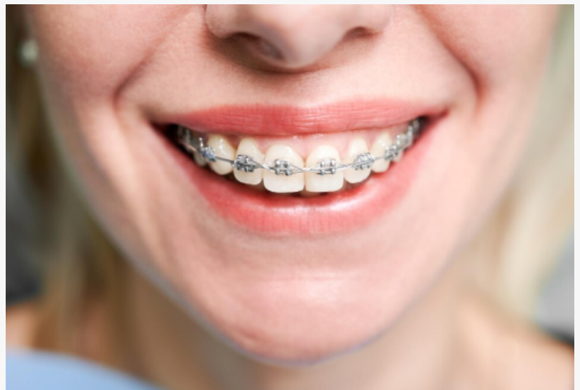
Dental Braces in Los Angeles

The increasing interest in dental braces in Los Angeles, CA, is largely driven by the availability of diverse treatment options. While traditional metal braces remain a cornerstone of corrective care due to their reliability and cost-effectiveness, the market has seen a significant shift toward aesthetic and "invisible" alternatives. Ceramic braces, which utilize tooth-colored brackets to blend with the natural enamel, have become a preferred choice for adult professionals and self-conscious teenagers.