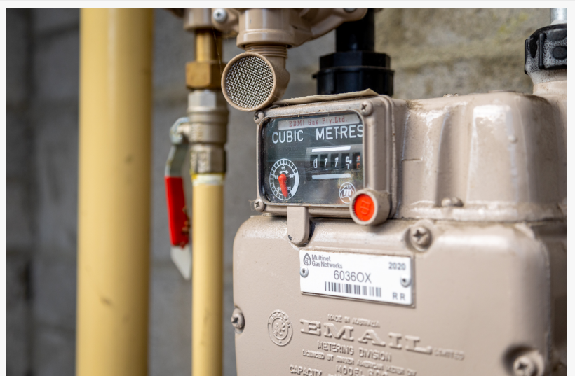
A household utility meter reflecting increased water and gas usage during Melbourne's peak summer months.

MELBOURNE, VICTORIA, AUSTRALIA, March 3, 2026 /EINPresswire.com/ -- As Melbourne heats up, households are quietly changing their water use, and plumbing professionals are noticing the effects on water use in Australian homes. From longer showers and more frequent laundry cycles to increased watering of gardens, outdoor play, and entertaining, summer puts sustained pressure on household plumbing systems. These habits are part of the relaxed Australian summer lifestyle. However, experts say they can also reveal underlying issues that remain hidden during cooler months.