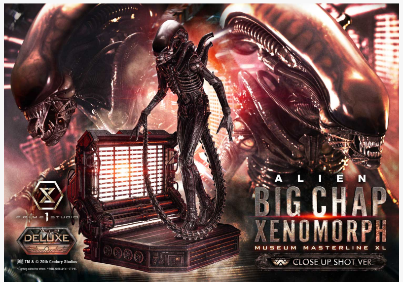
Museum Masterline XL Alien (Film) Big Chap Xenomorph Close Up Shot Ver.

Museum Masterline XL Alien (Film) Big Chap Xenomorph Close Up Shot Ver. DX Bonus Version