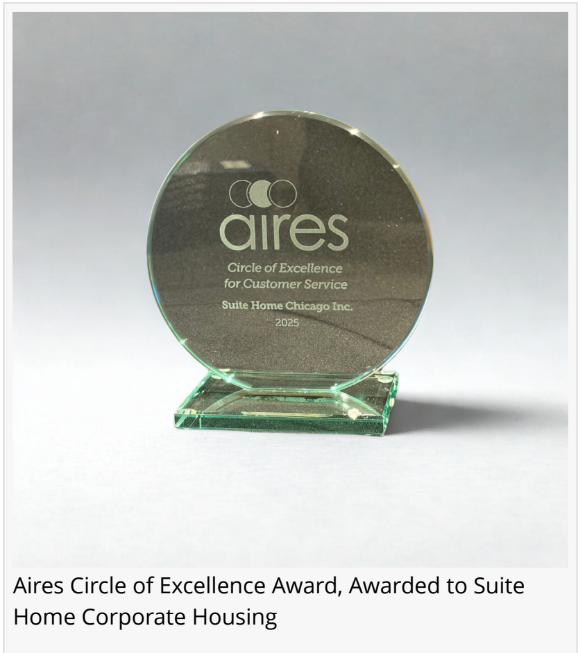
Aires Circle of Excellence Award, Awarded to Suite Home Corporate Housing

Suite Home received the Tower of Excellence "Advancing Excellence Award" from the Corporate Housing Providers Association ( CHPA ), recognizing the exceptional impact of its Account Management Team. Serving as the connective force of the organization, the team aligns sales, operations, reservations, and partner relationships to ensure a seamless client experience. Their strategic leadership and cross-functional collaboration have strengthened provider partnerships,