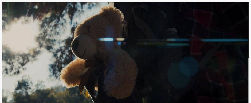
Film Still "Bear Lee: A Story"