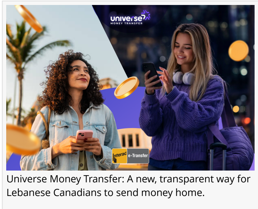
Universe Money Transfer: A new, transparent way for Lebanese Canadians to send money home.

/EINPresswire.com/ -- A new fintech entrant challenging established remittance operators, today launched its mobile-first money transfer platform, beginning with the Canada-Lebanon corridor. The FINTRAC-registered company plans to expand to 10 additional countries within one to three years as it scales its digital alternative to legacy transfer services, now available through its money transfer app for iOS and Android .