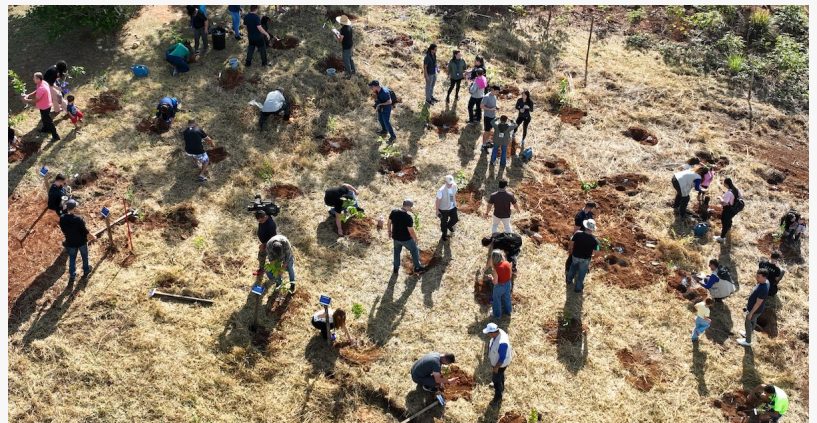
Verônica Cardoso, Fundação SOS Mata Atlântica — Planting of the Atlantic Forest Orchard through volunteer planting and seeding in South America during Make a Difference Week 2025.

The Restorative Continuum includes a range of activities and interventions that can improve environmental conditions and reverse ecosystem degradation and landscape fragmentation.