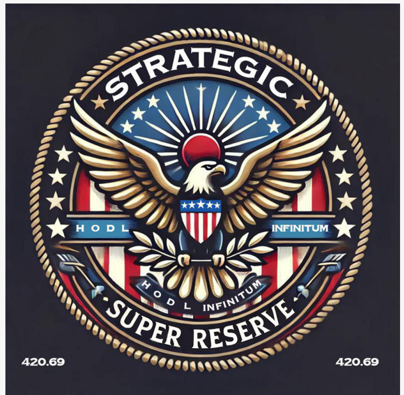
Strategic Super Reserve

By integrating with PumpSwap through Migrate.fun, SSR gains direct compatibility with one of the fastest-growing liquidity environments in the Solana ecosystem. PumpSwap has rapidly emerged as a key trading venue for emerging assets, enabling seamless token discovery, trading, and liquidity formation.