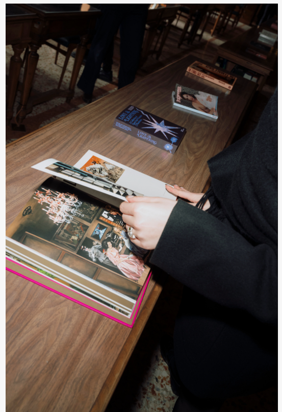
PhotoVogue event in Milan, 2026, a reader examines a copy of The Female Gaze in Art and Photography .