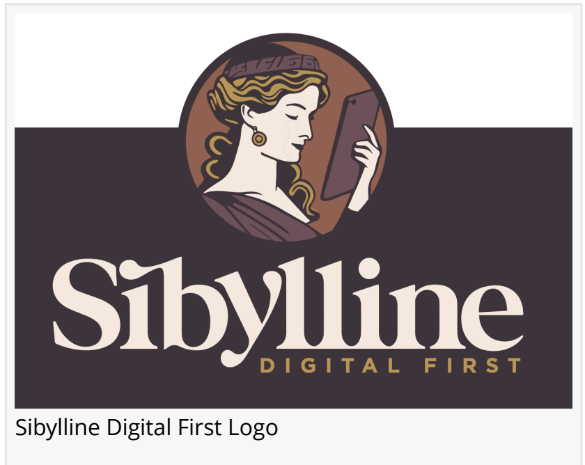
Sibylline Digital First Logo