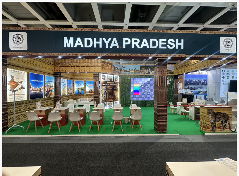
Madhya Pradesh Tourism Stall at ITB Berlin 2026