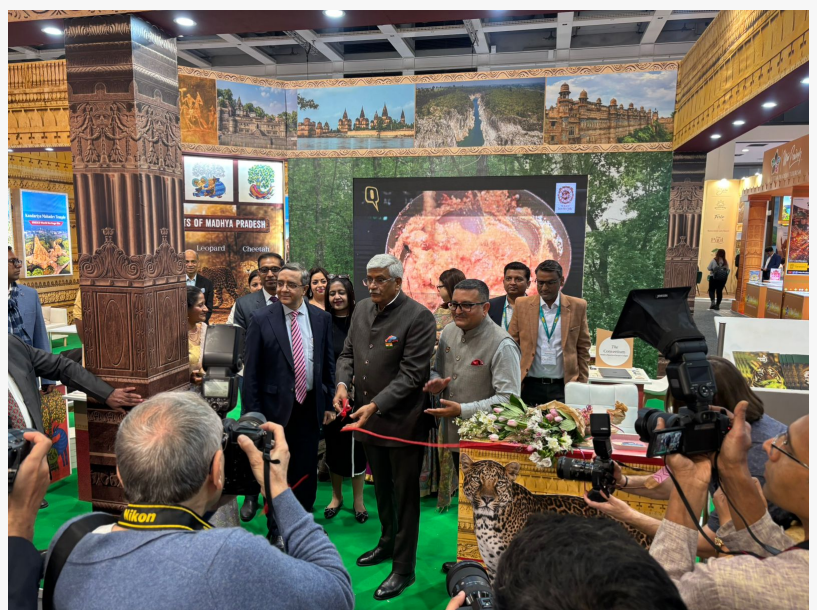
India's Tourism Minister Mr. Gajendra Singh Shekhawat inaugurates the Madhya Pradesh Tourism Board's stand

The Madhya Pradesh delegation represented a broad spectrum of the