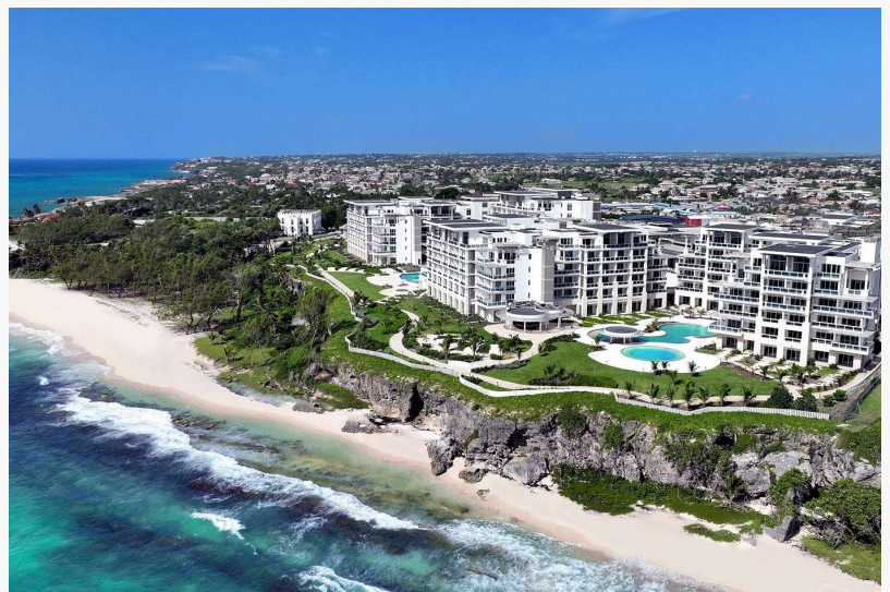
Wyndham Grand Barbados Sam Lord's Castle

ST PHILLIP, BARBADOS, March 6, 2026 /EINPresswire.com/ -- As loyalty programmes increasingly influence how travellers choose where to stay, Wyndham Grand Barbados Sam Lord's Castle Resort & Spa is encouraging Caribbean travellers to take advantage of a benefit many may not realize is available to them; earning free hotel stays around the world through Wyndham Rewards, one of the largest hotel loyalty programmes globally.