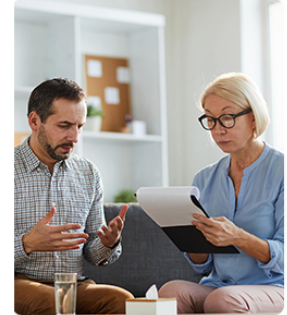
New View Wellness Clinical Team