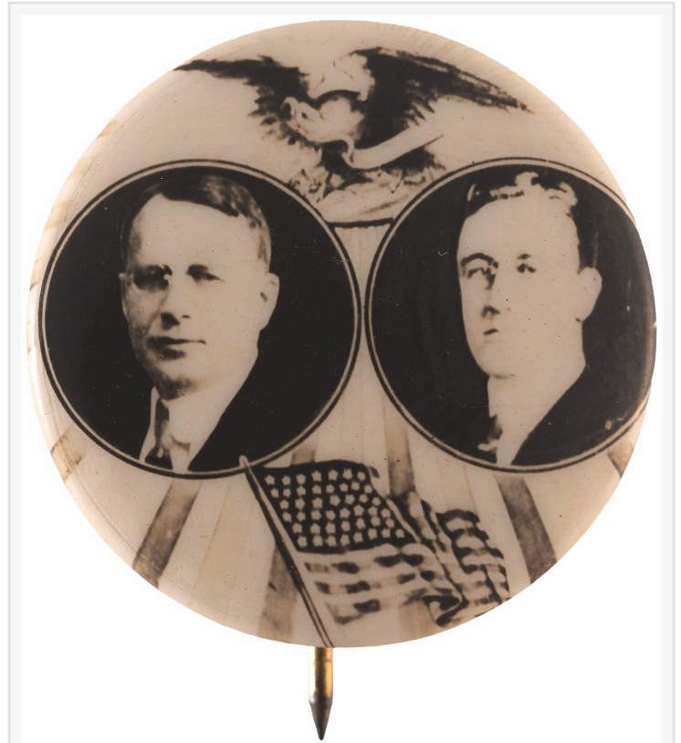
Cox & Roosevelt 1920 Democratic campaign jugate button, the most beautiful of all Cox/FDR varieties and the most coveted campaign button to be found, 1-7/8-inches diameter. Estimate: $25,000-$35,000

FDR makes another appearance with a "Re-Elect Roosevelt" 1936 campaign poster , a phenomenal example of Depression-era art that evokes the masterful WPA murals of that period. The poster is 24 inches by 34 inches and signed in print at lower left by artist "W Sanger." The striking graphics include six figures, each holding a union picket line poster. The bottom reads, "Amalgamated Clothing Workers of America," a detail that may indicate the auction