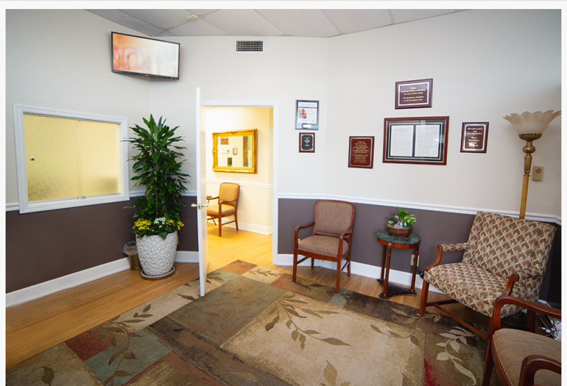
Carter-Rockbridge General Dentistry P.C.

In addition to educational videos, the website includes video testimonials from patients who have received treatment at the practice.