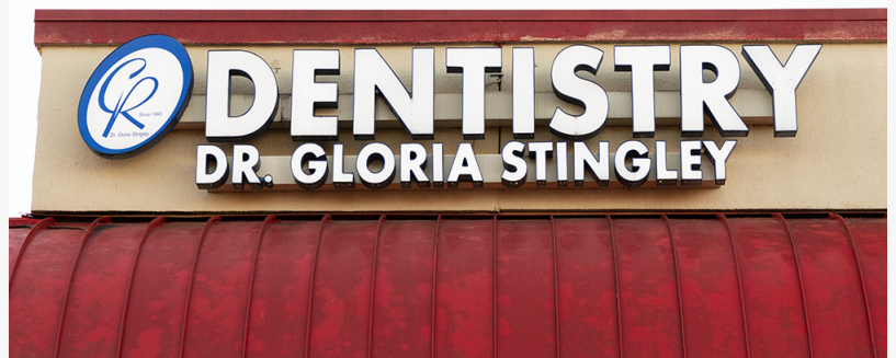
Carter-Rockbridge General Dentistry P.C. - Exterior