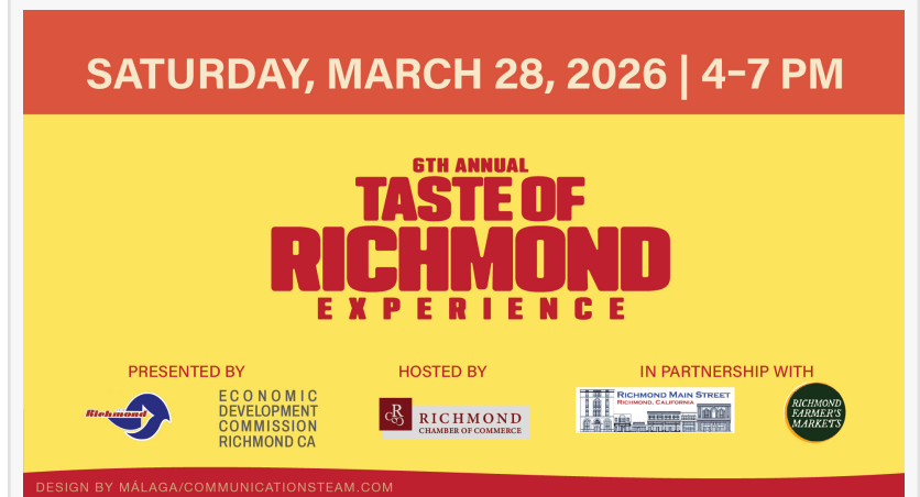
Taste of Richmond Experience 2026 Sponsors