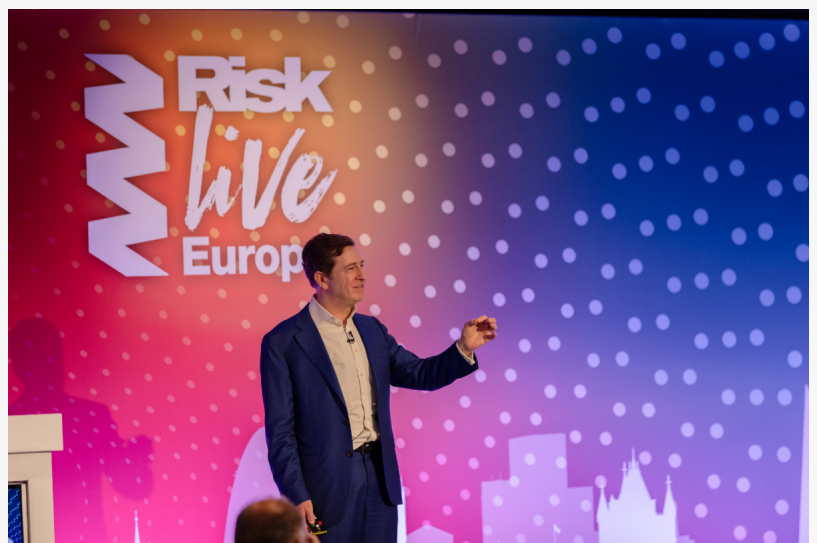
Risk Live Europe Closing Keynote by Roger Spitz in London

SAN FRANCISCO, CA, UNITED STATES, March 8, 2026 /EINPresswire.com/ -- Against the backdrop of a volatile start to 2026 - as the first quarter of the 21st century unfolds and global markets grapple with the collapse of historical data-driven models - the Disruptive Futures Institute announces an expanded global keynote tour for Roger Spitz . Anchored by the Strategic Imperative Series, "The Future of Predictability, Risk & Finance," this special edition tour addresses a world where "rare" is routine and traditional "Predict and Act" frameworks have reached their expiration date.