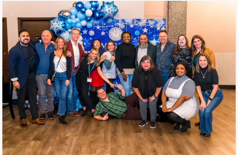
Beyond Ride Christmas Party photos 1