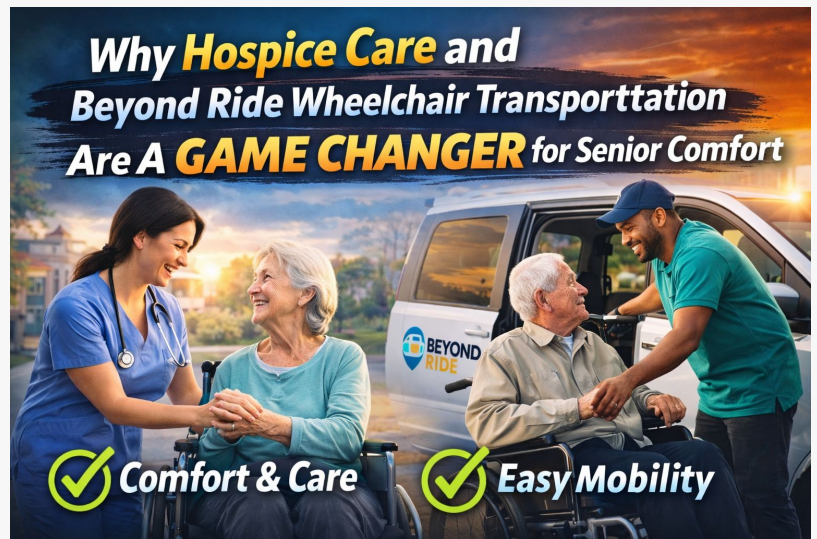
Why Hospice Care and Beyond Ride Wheelchair Transportation Are A GAME CHANGER for Senior Comfort

A recent moment in Tacoma quietly reflected this understanding when Envision Hospice was invited to attend Beyond Ride's Christmas community gathering. No partnership announcement was made and no formal collaboration was introduced. Yet the shared presence of these two organizations highlighted a meaningful possibility for improving how seniors experience care during some of life's most vulnerable moments.