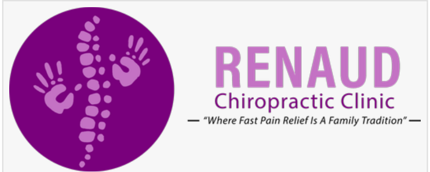
Renaud Chiropractic Clinic