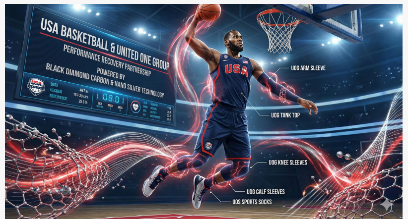
UOG Sports Socks. Basketball