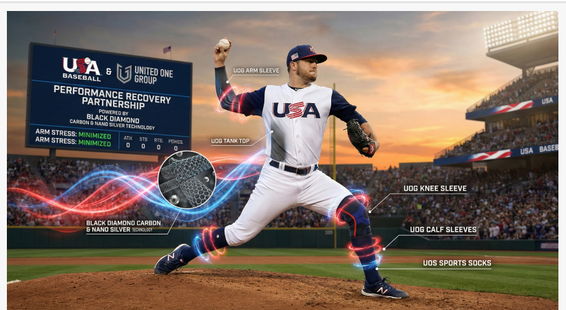
UOG sports socks-baseball