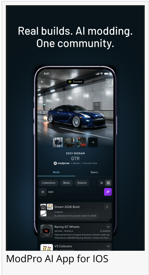
ModPro AI App for iOS

Unlike traditional social platforms optimized for reach and engagement, ModPro AI is optimized for usefulness. The platform emphasizes authentic, user-generated content—builds, parts and connections—and makes that content searchable and valuable to others. The company is