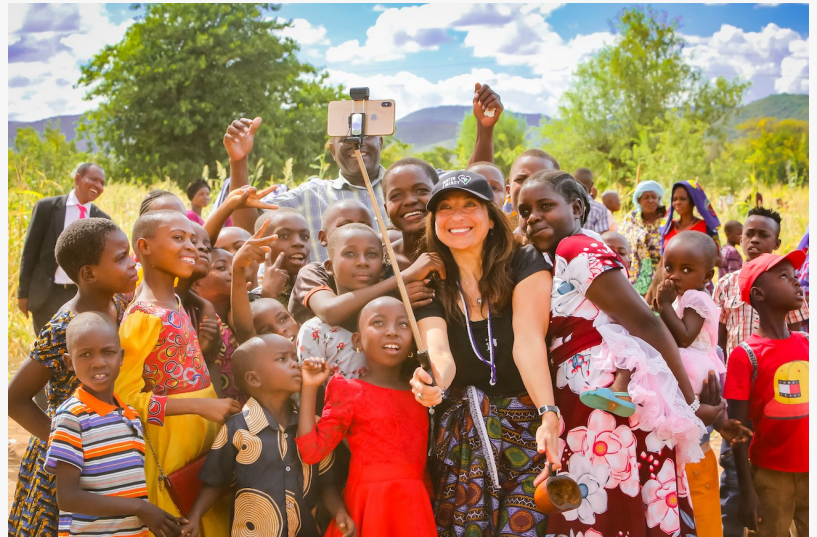
Providing Sustainable Clean Water & Agriculture Solutions.