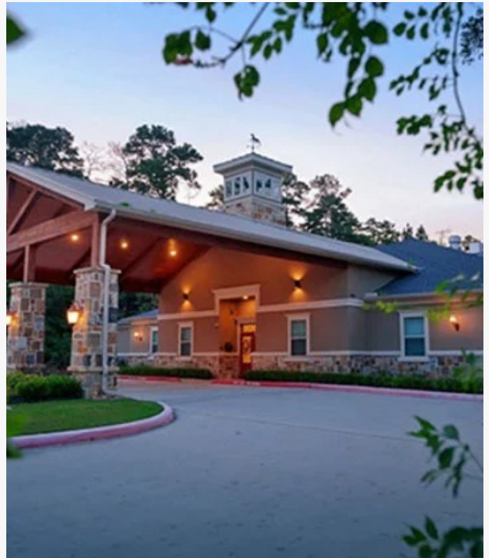
Memory care units Conroe