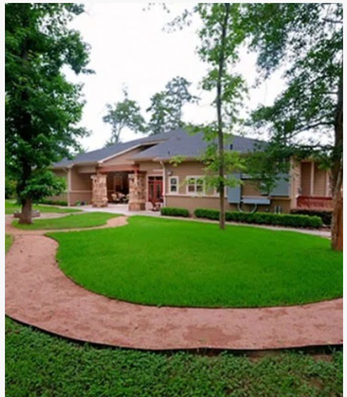
Alzheimer's support facilities Conroe-

Assisted living typically refers to residential settings where older adults receive support with activities of daily living such as bathing, dressing, medication management, and meal