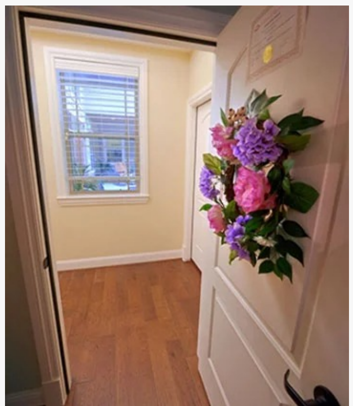
Memory care respite services Conroe

While assisted living may incorporate light memory support services, dedicated memory care