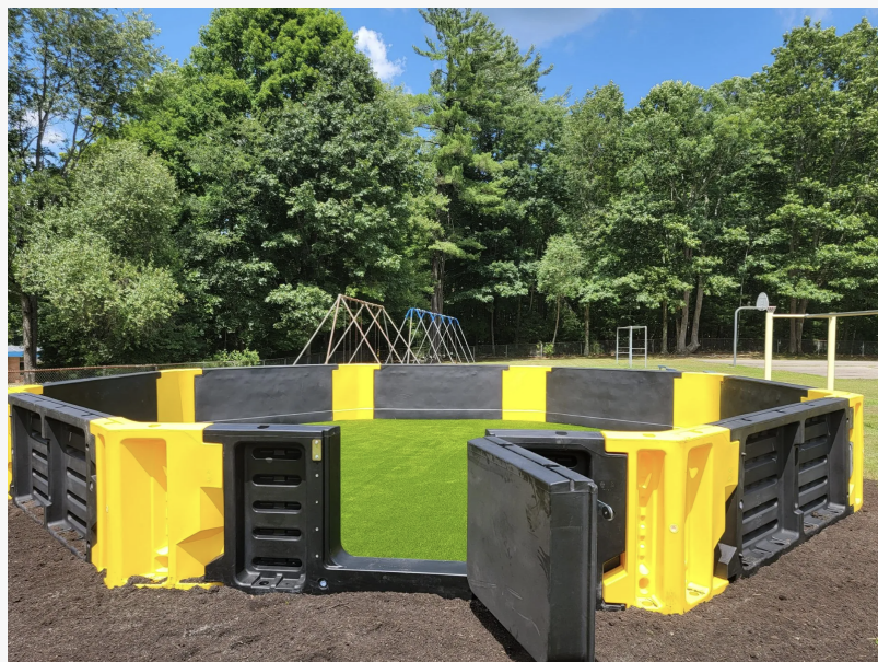
Outdoor Gaga Ball Pit