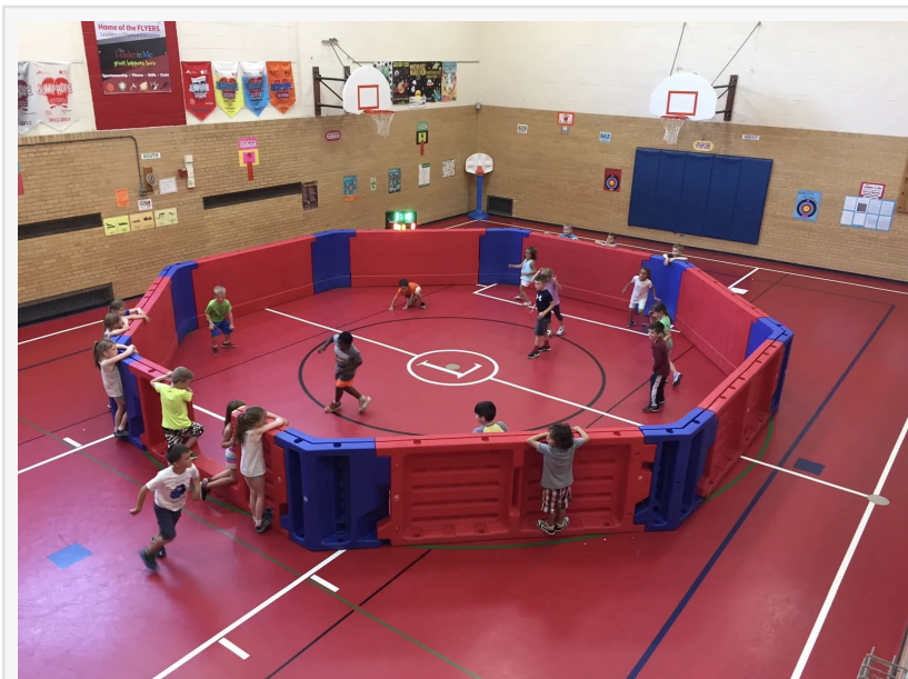
Gaga Ball Pit by SRG