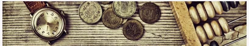
Houston factoring companies

Businesses can choose from several fast-funding options depending on their needs: Merchant Cash Advances (MCAs) are extremely fast and based on future revenue, though typically higher in cost. Invoice Factoring generates almost immediate cash advances on outstanding invoices. Invoice factoring services are offered by Catamount Funding, premier accounts receivable specialists, based in Houston, TX. Business Lines of Credit offer flexible access to funds as needed, and short-term loans typically offer fixed repayment terms with funding often available in 1-3 days.