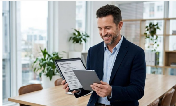
Coaches can now rapid-prototype curriculum and digital products using context-aware AI frameworks.

Transitioning from time-based billing to asset-based revenue using AI automation.