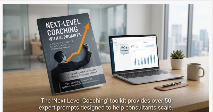
The 'Next Level Coaching' toolkit provides over 50 expert prompts designed to help consultants scale.

TOWNSVILLE, QUEENSLAND, AUSTRALIA, March 12, 2026 /EINPresswire.com/ -- Expert AI Prompts, a leading provider of industry-specific AI workflow solutions, today announced the launch of Next Level Coaching With AI Prompts, a specialized digital toolkit designed to assist coaches and consultants in transitioning from high-touch, one-on-one service models to scalable, asset-based businesses.