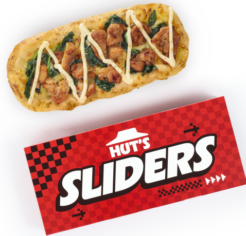
Truffle Spinach Chicken Hut's Slider