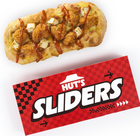
Ghost Pepper Cheese Chicken Hut's Slider