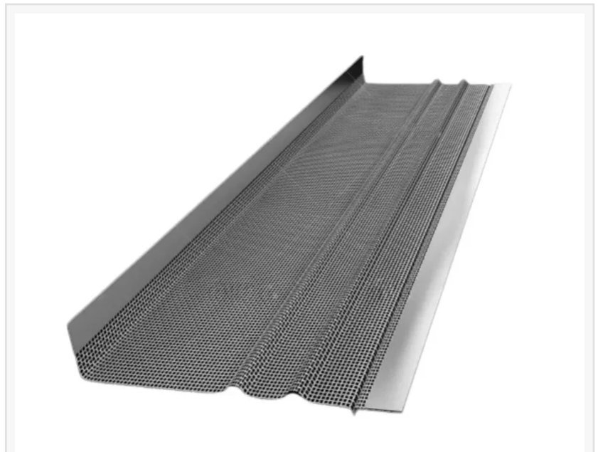
Clean Pro Guard

The platform also supports the company's proprietary Clean Pro Guard system, a micro-mesh gutter guard built from Type 304 surgical-grade stainless steel. Introduced in 2024, Clean Pro Guard addresses material degradation issues common in aluminum and vinyl alternatives. Aluminum guards are susceptible to galvanic corrosion when paired with dissimilar metals in the gutter assembly, and vinyl guards degrade under UV exposure within three to five years. The 304 stainless steel micro-mesh resists both failure modes. Clean Pro Guard installation is available across the full 840-city service area, with 200 dedicated metropolitan pages providing guard-specific pricing and installation details. Every guard installation includes a 1-year workmanship warranty and a lifetime no-clog guarantee.