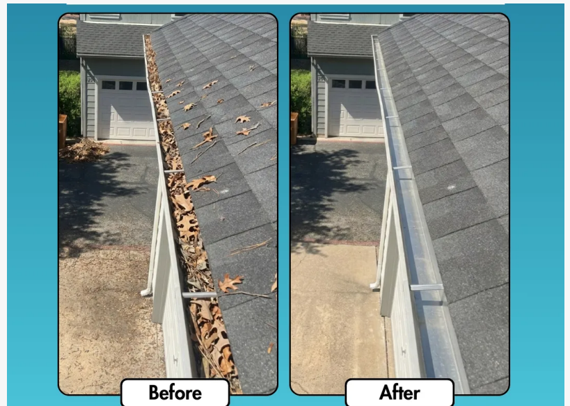
Clean Pro Gutter Cleaning Before And After Cleaning Service

Every completed gutter cleaning includes Clean Pro's 30-day warranty. If gutters clog within 30 days of service due to natural debris, the company dispatches a contractor to re-clean the property at no additional charge.