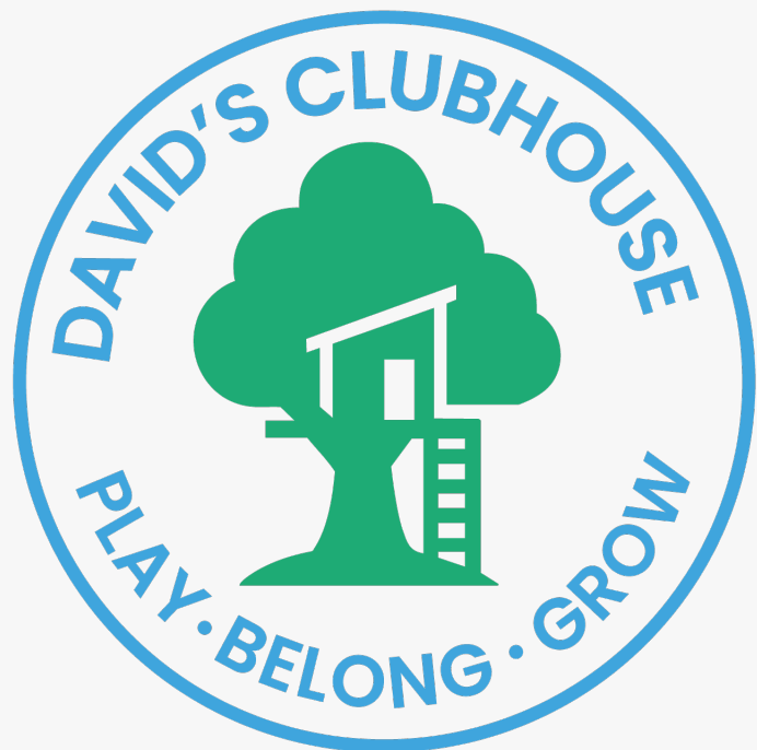
David's Clubhouse Indoor Playground