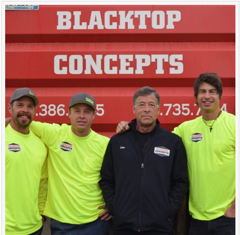
Blacktop Concepts - Wisconsin Team

"The homeowners who book in March are always the ones showing off a finished driveway by Memorial Day. They get their project done, they get their summer back, and they never have to think about it again," said a representative of Blacktop Concepts. Understanding the paving timeline can help homeowners plan more effectively. A driveway scheduled in early spring is typically completed and fully cured before the first summer gatherings arrive. Homeowners looking to understand project costs ahead of time can use the driveway cost calculator at blacktopconcepts.com to get a preliminary estimate based on their specific project parameters.