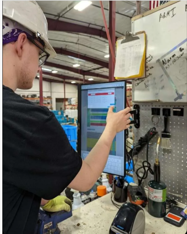
RotoEdge Pro helps Manufacturers increase margins, track customer projects and reduce scrap.

Manufacturing Next Steps with AI The RotoEdge Pro Team will present ways that manufacturers can utilize Artificial Intelligence (AI) to evolve from paper scheduling to real-time AI-based recommendations that help them lower scrap rates, increase efficiency and productivity, and optimize margins.