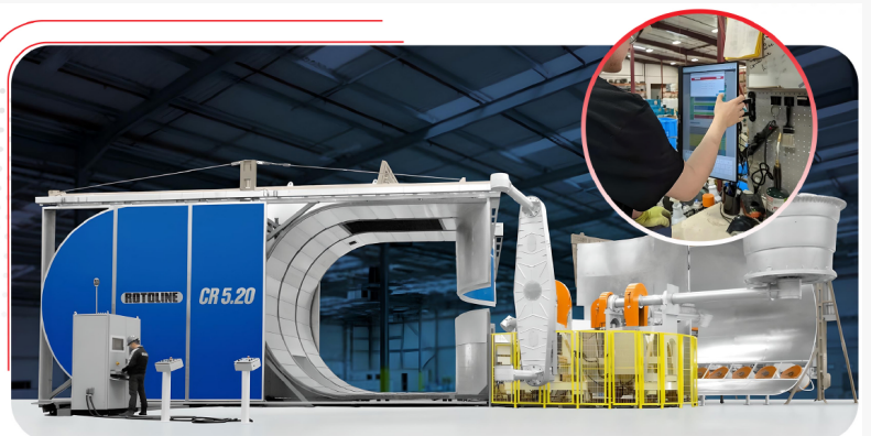
RotoEdge Pro lets manufacturers schedule better, reduce scrap and increase revenue.