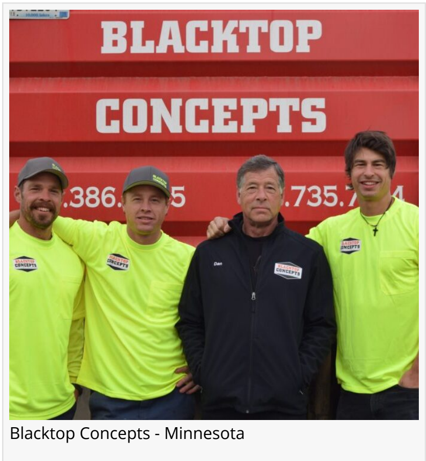
Blacktop Concepts - Minnesota

Blacktop Concepts is a family-owned asphalt paving company serving residential and commercial clients across the St. Paul area and eastern Twin Cities metro with decades of experience. Based in St. Paul, Minnesota, the company specializes in residential driveway installation, replacement, resurfacing, extensions, private road paving, and parking lot surfaces. Known for reliable scheduling, transparent project timelines, and durable results built for Minnesota's freeze-thaw climate, Blacktop Concepts serves communities across Ramsey, Washington, and Dakota Counties.