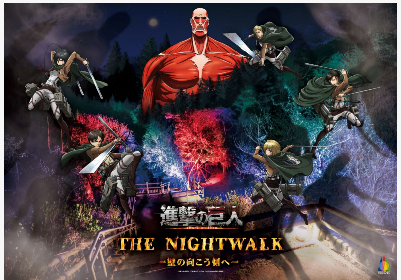
□Attack on Titan THE NIGHT WALK -Beyond the Walls-

Furthermore, in addition to Nijigen no Mori-exclusive original merchandise, original food items themed around characters such as Eren Yeager and Levi will also be newly introduced.