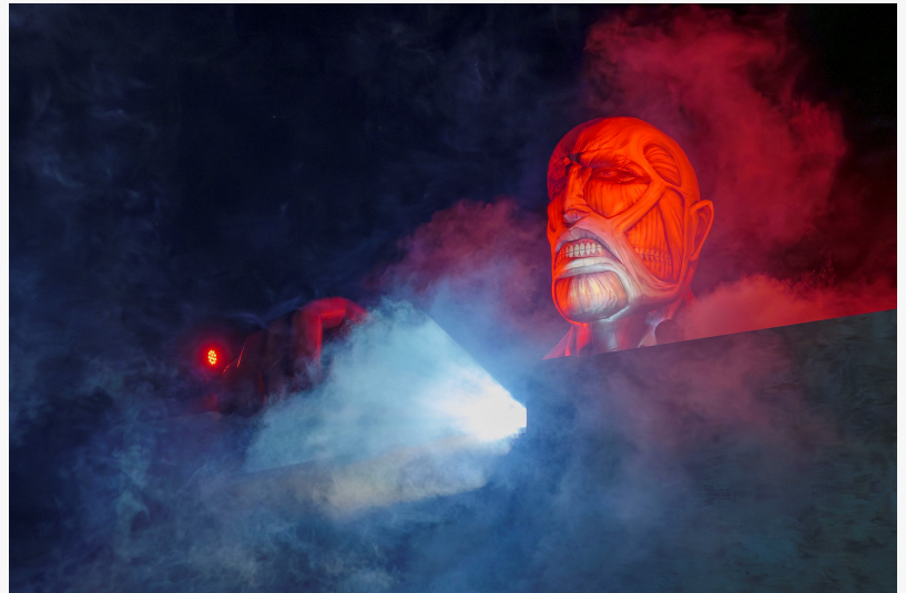
□ Preview of "Attack on Titan THE NIGHTWALK -Beyond the Walls-"

This event features two programs, a night event "Attack on Titan THE NIGHT WALK -Beyond the Walls-" and a daytime event "Attack on Titan Stamp Rally in Nijigen no Mori," allowing guests to fully immerse themselves in the world of the TV anime "Attack on Titan" both day and night.