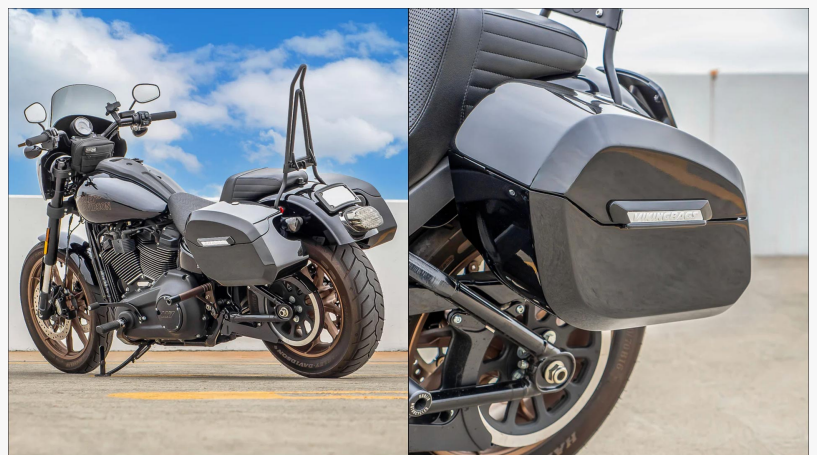
Viking Bags Unveils Patented Quick-Mount Motorcycle Saddlebag System

Quick-Mount System: Includes a side carrier that mounts to the motorcycle. The saddlebag slides onto the carrier and locks into place without drilling or tools. Intended for riders who transfer