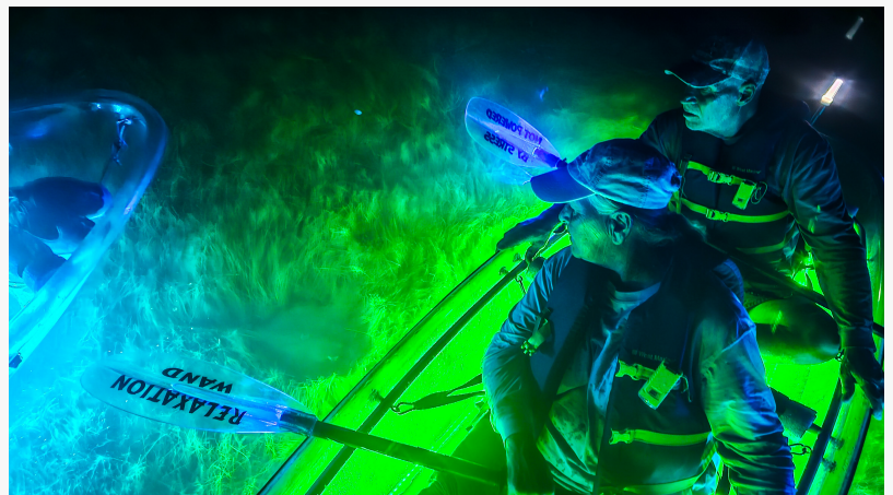
Close-up of GlowRow guides paddling a glowing kayak, highlighting proprietary LED systems and safety gear in an immersive nighttime tour.