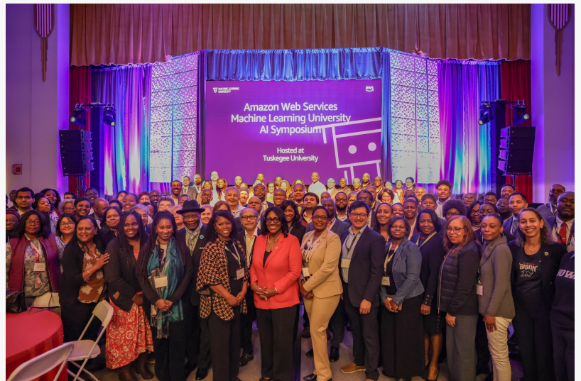
Oklahoma City Community College leadership attends AWS AI Symposium