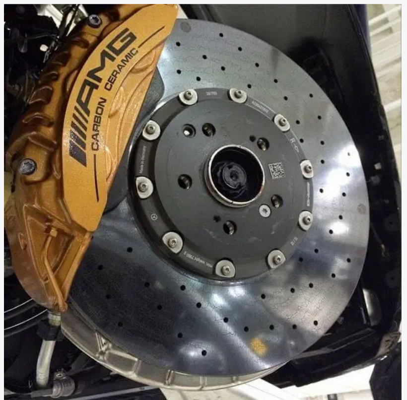
Mercedes AMG Brake Repair Service

Drivers who suspect brake wear can learn more about professional service by visiting the Mercedes-Benz brake job service page , which explains the repair process and maintenance recommendations for Mercedes vehicles.