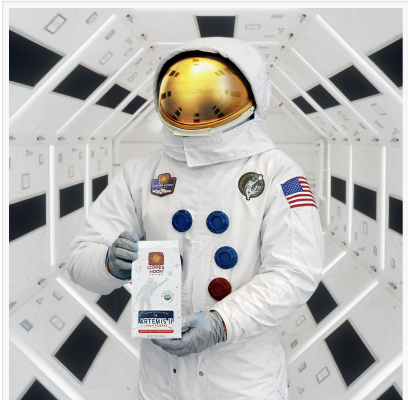
Copper Moon Coffee, the award-winning, family-owned roastery, proudly announces the launch of its Artemis II Lunar Reserve, a limited-edition organic coffee.