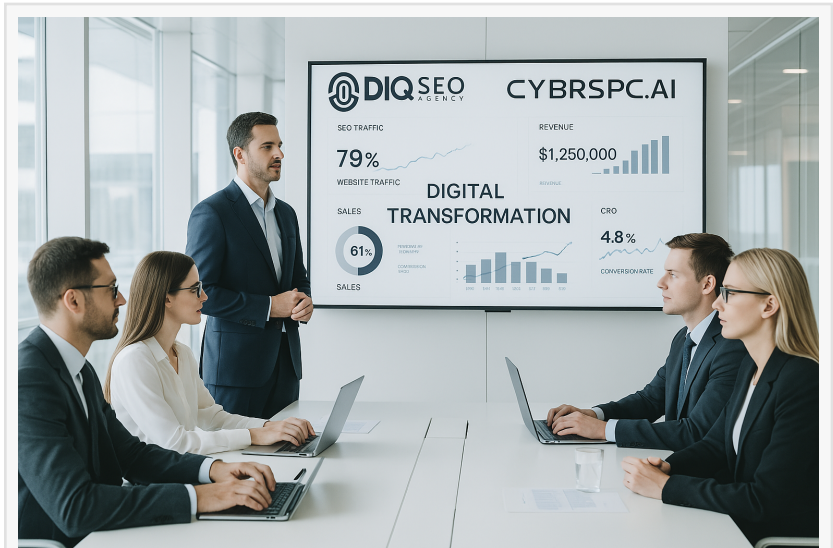
SEO Compay in Fredericksburg Texas

Website chatbots that remember conversations and maintain context across sessions