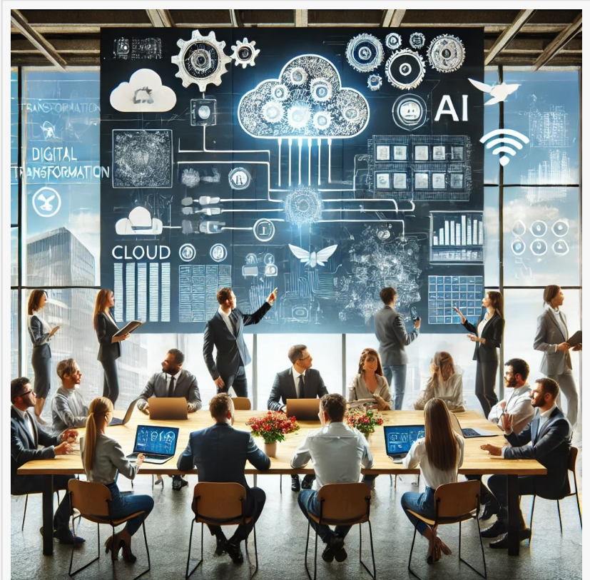
Ai Automation for Business in texas

The vision is a system where a business can run with far less friction—while maintaining governance, approvals for high-risk actions, and complete transparency into what changed, when, and why.